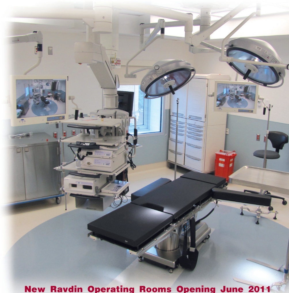
New Ravdin Operating Rooms Opening June 2011