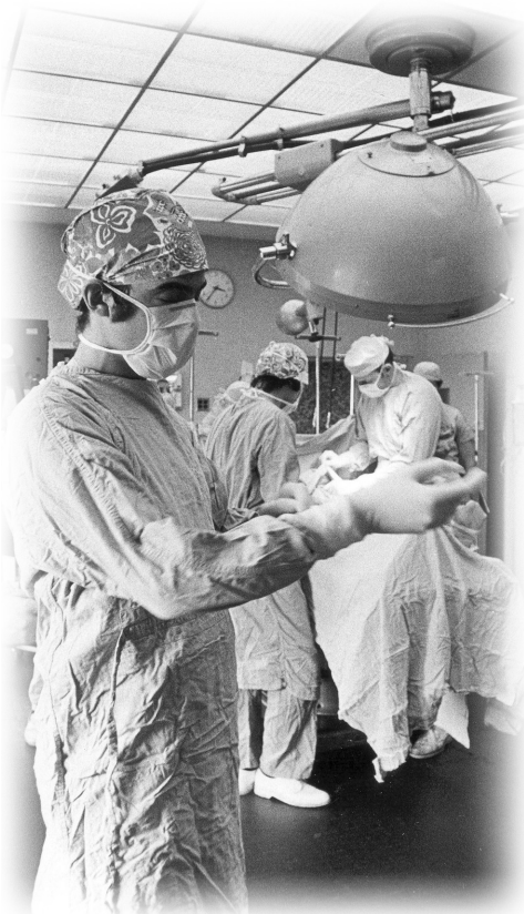
"Old" Ravdin ORs 1962-1987